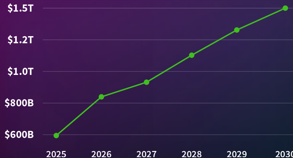
Digital Marketing Industry Revenue Forecast